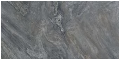
GRIS DT (Digital Texture)